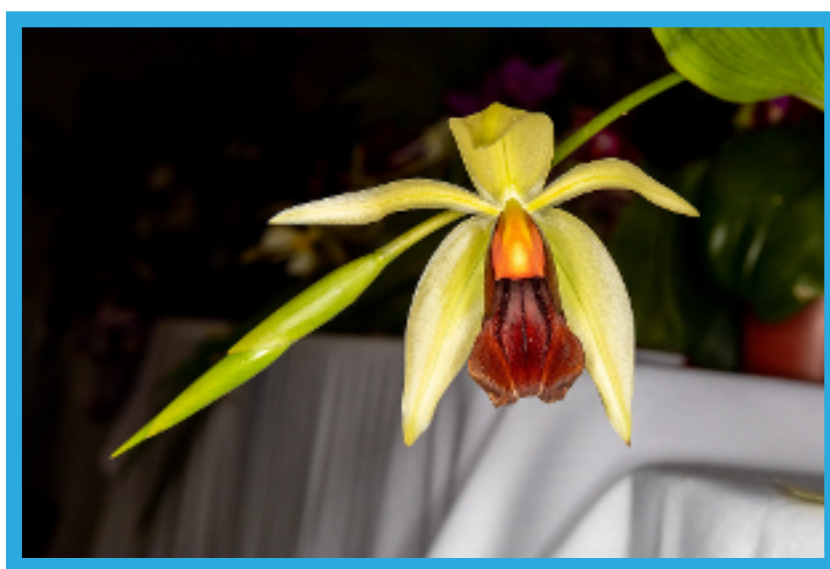
Coel. lawrenceana x Coel. usitana - Carl Wood