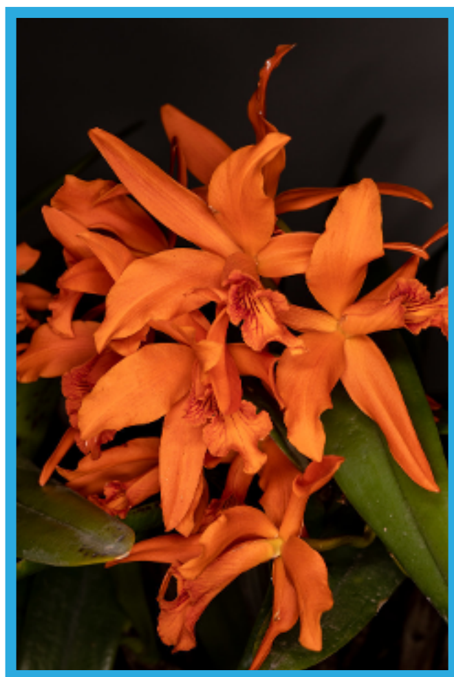
L. Zip 'Ship Shape' x Lc. Trick or Treat 'Orange Magic' - Carl Wood