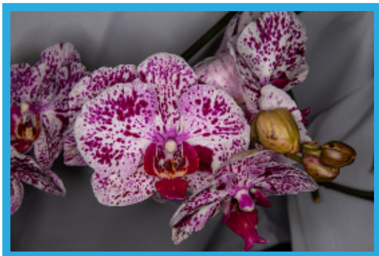
Phal. Hybrid