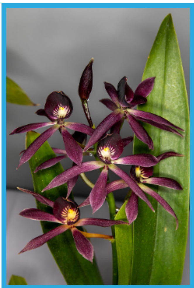
Grc. Black Comet 'Indigo Blue' - Suzi Sandore