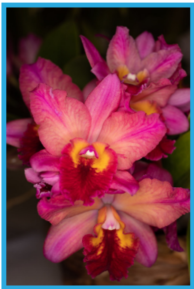
AMN-111 (C. intermedia orlata 'Crownfox' x Slc. Circle of Life) - Alex Nadzan